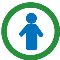
Tested swimmers permitted to enter alone