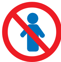
Children under 6 admitted only with parent or guardian